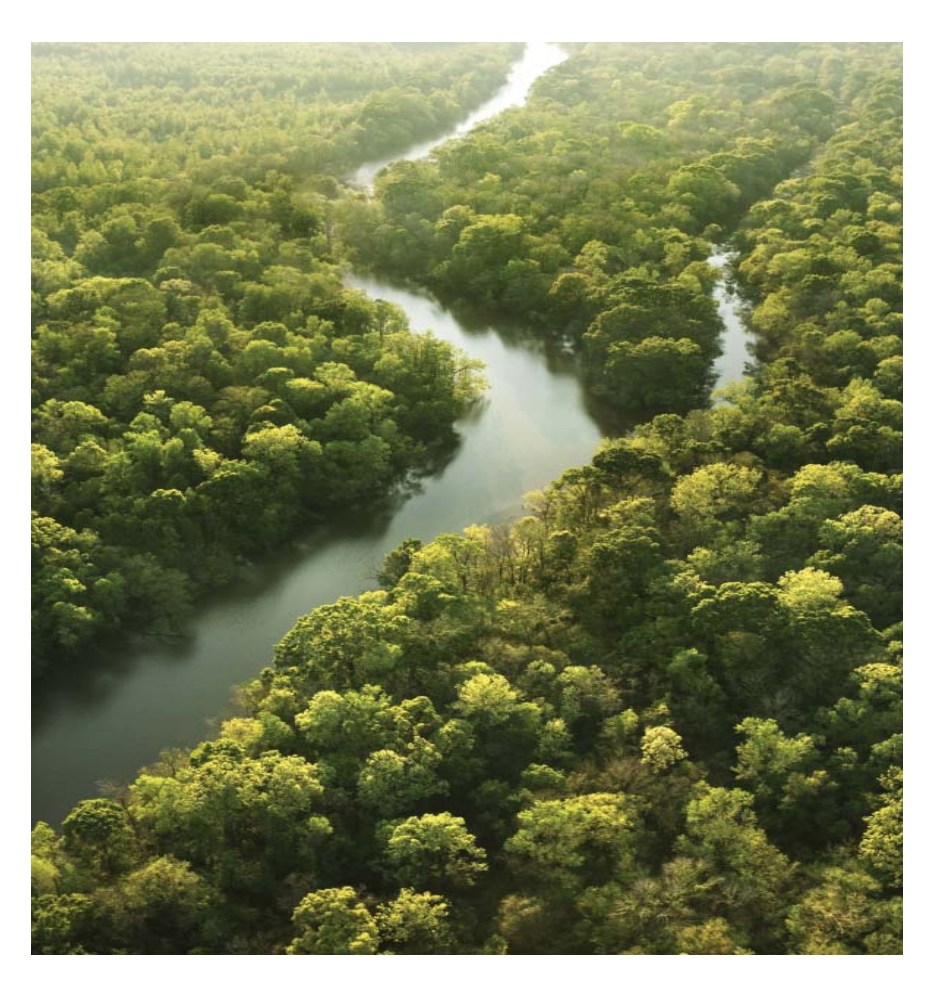
A Landowner's Guide to Forestry in South Carolina

South Carolina's forestry community is committed to practices that promote sustainable forestry. This includes growing more than it harvests, protecting fish and wildlife habitat, minimizing the visual impact of harvesting, and adhering to Best Management Practices. We're working together to ensure that South Carolina's forests are growing for the future. With sound information, commitment, and good planning, you can also be a part of this legacy.